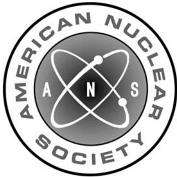
Fig. 1. This is the ANS logo.